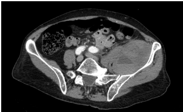
Figure 3: A transverse view of intrabdominal haematoma secondary to iliopsoas rupture seen on contrast CT. No tracking is seen to from aorta to haematoma.

Intra-abdominal haematomas causing secondary hydronephrosis are extremely rare with only a few cases being previously reported in the literature comprising of 5 case reports. Of these the most common cause is a haematoma secondary to bleeding from the rectus sheath [1-6]. Only one case has been reported involving the iliopsoas muscle [6]. It has never been reported in a patient with Marfan's Syndrome. Anticoagulation, or a tendency to bleed such as disseminated intravascular coagulation, can predispose individuals to intra-abdominal bleeding, resulting in haematoma formation and secondary hydronephrosis [4,5].