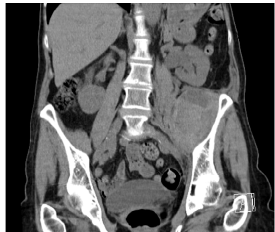
Figure 1: A coronal view of the left iliopsoas haematoma causing hydronephrosis.

Marfan's syndrome is an autosomal dominant connective tissue disorder with many associations including aortic aneurysm or dissection, aortic or mitral valve prolapse and spontaneous pneumothorax. Marfan's syndrome is characterised by mutations in gene FBN-1. Glycoprotein fibrillin-1 is encoded by FBN-1 and contributes to formation of connective protein elastin and extracellular matrix. Tissue in which elastin is abundant such as blood vessels are commonly affected by Marfan's syndrome due to altered elasticity, resulting in aneurysm and rupture.