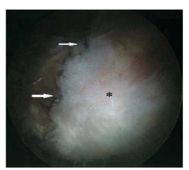
Figure 5: Gluteus medius fixing with suture with two-track anchors.