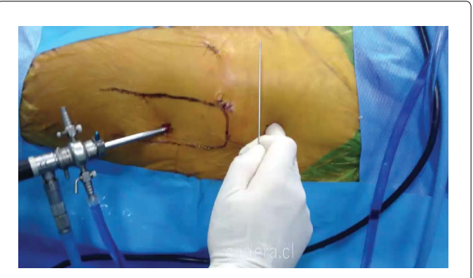
\textbf{Figure 1B:} \ \ \text{The superior portal is performed, first by inserting a needle guide.}

Resonance will distinguish between these similar clinical pathologies.