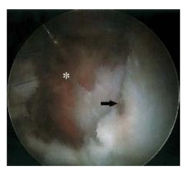
Figure 4: Gluteus medius injury identification.