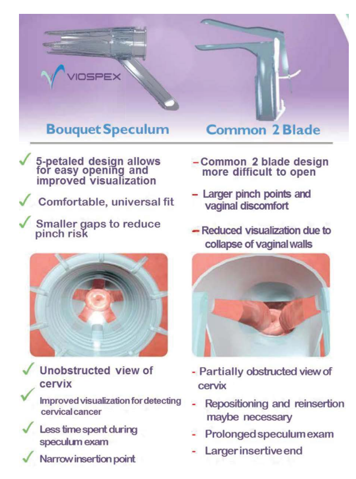
Figure 1: Comparison of 5-petaled vs. 2-bladed speculum.

less expensive than our competitors and designed with an oblique handle that can be used on any cot, bunk, bed or table. It is not necessary to have a designated gynaecology table with foot rests. This makes it a great tool to screen women in low-resource countries.