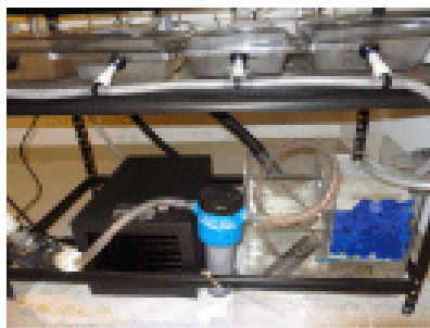
Figure 4: The drainage tubes are carrying contaminated water from the tanks into the wet dry filter complete system. The main mechanisms are the particulate filter, wet dry filter complete system, and chiller.

Assemble the wet dry filter complete system (WD-100CS) per the manufacturer's recommendations. This system will provide two components of the water purification system, charcoal bags and bio balls. The charcoal is one of four components of the water purification system. It will remove certain impurities such as chlorine while ignoring others like nitrates, which will be addressed by other components of the water purification system. The bio balls within this system will provide the surface for the growth of denitrifying bacteria to remove nitrates from the water. Place this system on the right side of the rack, underneath the bottom shelf (Figures 2 and 4). Make sure that the drainage tubes are placed into the charcoal/bio ball compartment of the wet dry filter complete system (WD-100CS).