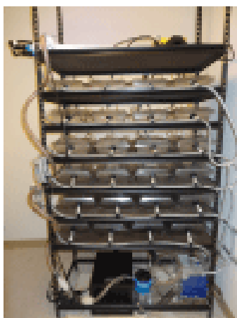
Figure 2: Front view of assembled water system (photo).

Once all twenty four tanks are placed on the assembled rack, the drainage system can be constructed (Figure 2). For the first tank on the left side of each row, cut a 10" piece of \frac{1}{2} " I.D., vinyl reinforced clear tubing (TVR70) and insert it into the tubing adapter tee (62123) in such a way that it curls up the side of the rack's column (Figure 1). This will allow oxygen into the drainage system to help with the water flow. It may help to soak the vinyl tubing in hot water before sliding them over the barbs of the tubing adapter tees (62123). For the interior tanks on each shelf cut 11 inches of \frac{1}{2} " I.D., vinyl reinforced clear tubing (TVR70) to connect to the other tanks tubing adapter tees (62123). Each shelf has its own drainage line; however, the drainage lines for shelves 1 and 2 are coupled together as well as 3 and 4. These two pairs are connected using a \frac{1}{2} " x \frac{1}{2} " x \frac{1}{2} " plastic barb tee (A-381). This was done to increase flow of water into the wet dry filter complete system (WD-100CS).