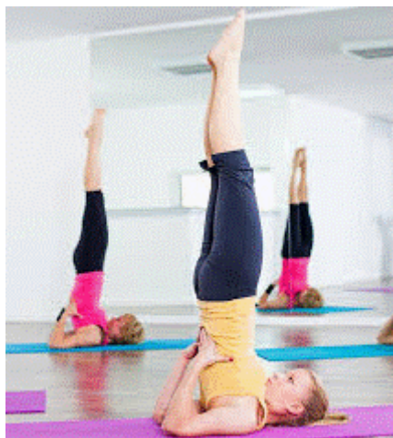
Figure 2: Whole body bending coupled with breathing.