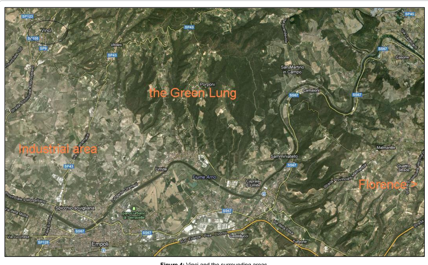
Figure 4: Vinci and the surrounding areas.

Citation: Tortora M, Randelli F, Romei P (2014) A Conceptual Framework for Tourism Transition Areas Based on Territorial Capital: a Case Study of Vinci. J Tourism Hospit 3: 135. doi:10.4172/2167-0269.1000135