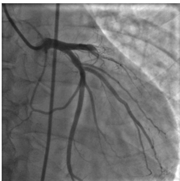
Figure 1: Coronary angiography at the present admission. Stent thrombosis occurred in the proximal tract of the left anterior descending artery 18 years after indexed procedure.

eosinophilic infiltrate and peristut fibrin deposition. Despite that, the presence of intimal regeneration does not necessarily mean in stent endothelial recovery of function. In fact, in stent atherosclerosis and restenosis processes are strongly associated with impaired endothelial function [7]. Furthermore, in iliac artery rabbit study, Joner et al. [8] found that, despite varying degrees of endothelial coverage, the staining of thrombomodulin, a physiologically relevant regulator of platelets and coagulation, was absent or only weakly expressed in 14- and 28-day DES, and was even reduced in BMS control stents compared with non-stented segments. This finding may be of clinical importance because the occurrence of the strut coverage with dysfunctional endothelium could play a primary role in determining a local thrombosis in absence of antiplatelet regimen.