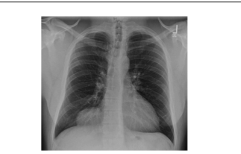
Figure 1: Chest radiograph showing a soft tissue mass occupying the right hemithorax.

The patient is a 37-year-old male who presented to the Emergency Department complaining of worsening right "rib pain" for four months.