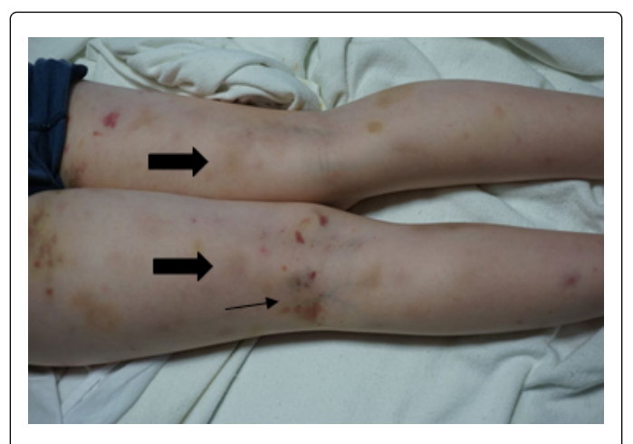
Figure 2: Palpable purpura (thin arrow) and urticaria (thick arrow) on the patient's legs.

Initial labs revealed normal CBC, BMP, urinalysis, hematologic and rheumatologic work ups. Significant findings included a low C4 complement and elevated ASO titers. Punch biopsies were taken from purpuric and urticarial lesions on the abdomen and thigh. Hematoxylin and eosin (H&E) stains were significant for a peri and intravascular infiltrate of neutrophils and eosinophils involving the superficial and deep vascular plexuses (Figures 3 and 4). Direct immunofluorescence (DIF) revealed an IgA vascular deposition (not shown). These findings were consistent with Henoch-Schonlein Purpura (HSP).