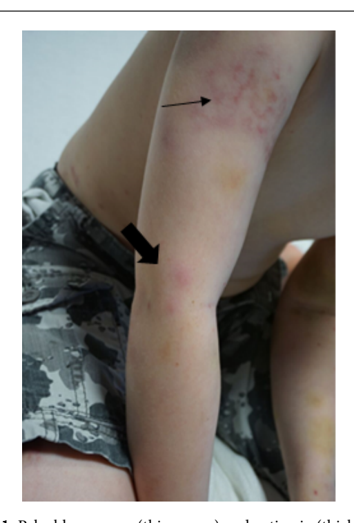
Figure 1: Palpable purpura (thin arrow) and urticaria (thick arrow) on the patient's arm.

healing on the trunk, bilateral upper and lower extremities, buttocks, and genitalia; sparing the face, palms, and soles (Figures 1 and 2). Evanescent urticarial plaques were also noted on the body throughout the hospital stay.