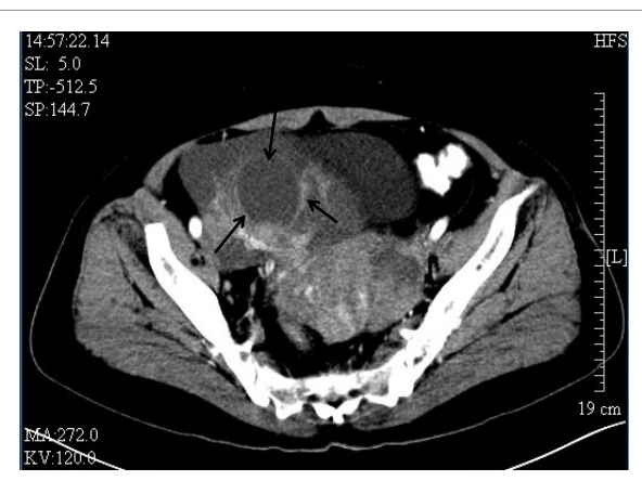
Figure 1: Enhanced computed tomography scan of abdomen and pelvis reveals that an 8.5×8 cm mass (arrows) in the right pelvic with scatter rim enhancement in the right annex. The lesions invade the right side of cyst.

The xanthogranulomatous lesion is a rare chronic inflammatory disease characterized by the focal or diffuse destructive inflammatory process, with accumulation of lipid-laden fibrous tissue, and acute and chronic inflammatory cells; It may involve any organ, but the most common sites are known as the gallbladder and kidney [8]. The xanthogranulomatous inflammation involving the salpingitis and cystitis simultaneously is very rare. However, it may be