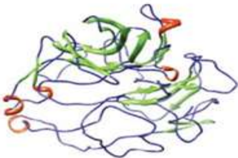
Figure 1: The final considered model from Modeller output (Visualisation by Chimera).

Figures/ Images/ Graphs/ Table (both Color and BW) if any