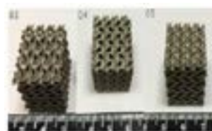
Figure 2: 316L gyroid structure samples manufactured using SLM.