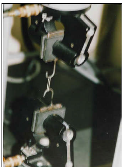
Fig.1. Instron universal testing machine