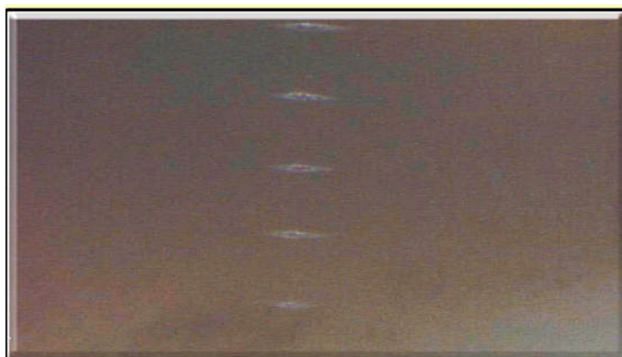
Fig.5. Microscopic indentations

The degree of softened dentin removal was determined by KHN measurements of the cavity floor and the adjacent sound dentin as suggested by Aoki and others (1998). The results of KH measurements of the carisolv cavity floor confirmed that the possibility of remaining residual, softened dentin was minimal in this study because no statistically significant differences were noted in microhardness of the carisolv cavity floor dentin and the adjacent sound dentin (reference control)( Fig.5 ). The results further indicate that accurate evaluation of KHN is possible in this methods used in this study, and the efficiency of complete carious dentin removal by the carisolv chemo-mechanical system is no longer difficult when a proper clinical guide is used.