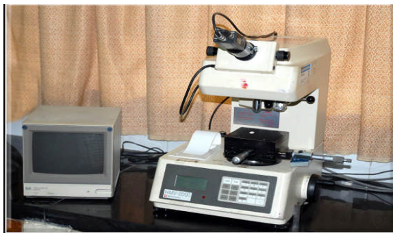
Fig.4. Microhardness Measuring device

texture was reached or a sharp scratching sound was heard. As these methods are operator dependent, so we recommend a combination of hardness testing by explorer and DIAGNOdent. In this study, initially, gross caries removal was verified according to the color and hardness of the lesion, with a sharp explorer subsequently, the treated cavity was carefully assessed by means of DIAGNOdent. The usefulness of this device for the assessment of the carious dentin removal has previously been reported 3-6 . Further research on the ability of DIAGNOdent to detect dental caries should be performed.