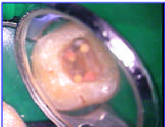
Fig.5.: All the 5 canals are obturated