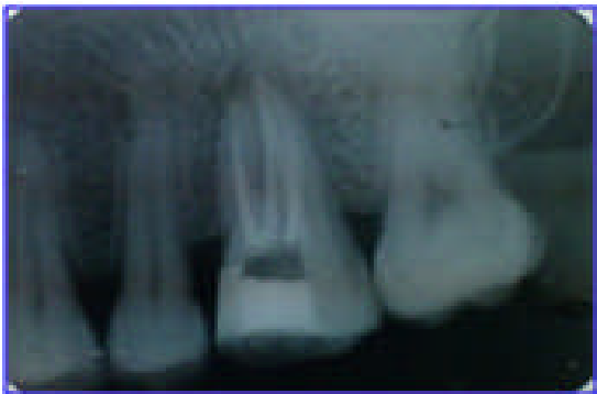
Fig.4. Immediate post operative radiograph