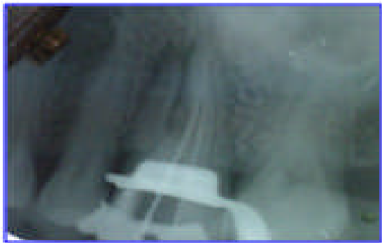
Fig.3. Working length radiograph with instruments in five canals