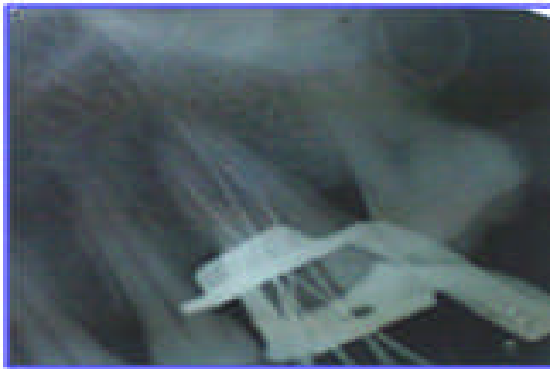
Fig.2.Two palatal canals joining at the apical third