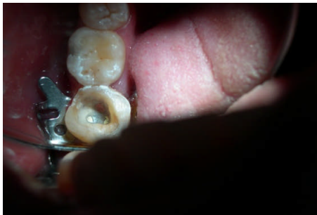
Fig.6. Photographs after obturation.