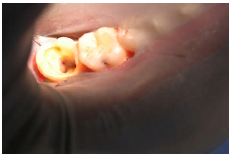
Fig.2. Photograph showing the presence of extra distal orifice