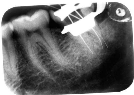
Fig.3. Radiographic confirmation of extracanal and foramen in the extra distal orifice