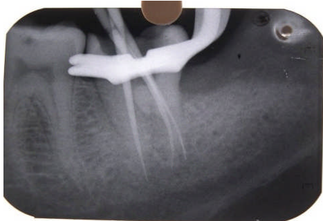
Fig.5. Check X-rays with master cones in the canals