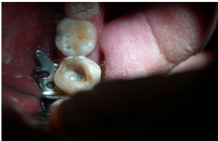
Fig. 4. Photographs after enlarging the canals