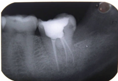
Fig.8. Follow up radiograph.