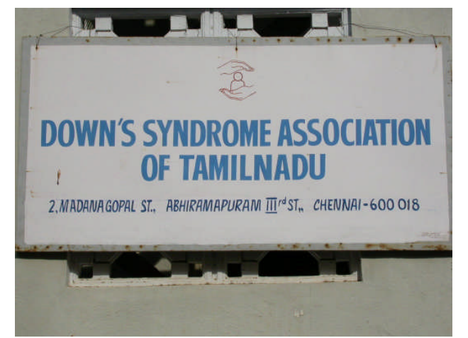
Address of Down's syndrome association in TN Fig. 3