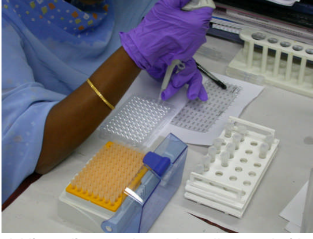
Adding saliva samples to the wells coated with IgAantibody Fig. 5