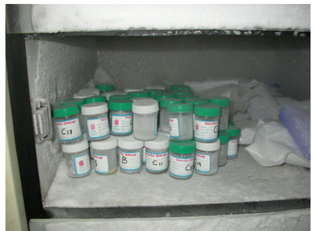
Saliva samples stored at -70°c (cryoscientific Inc Fig. 4