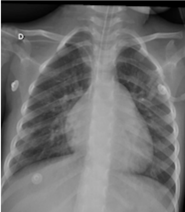
Figure 2. Chest radiograph 48 hours after surgery when the patient had improved

recipients with primed neutrophils due to an underlying disease. A second proposed mechanism relates to the transfusion of bioactive factors that activate primed neutrophils in the lungs causing direct pulmonary endothelial damage, capillary leak, and acute lung injury [6].