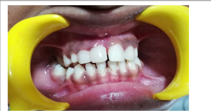
Figure 7: It restored with the composite build up and planned for implant prosthesis in the future after completion of growth.