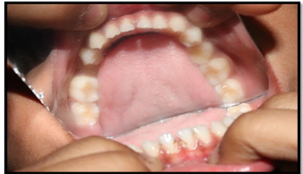
Figure 4: Intraoral examination inner view.