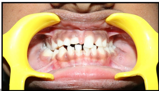
Figure 3: Intraoral examination of teeth.