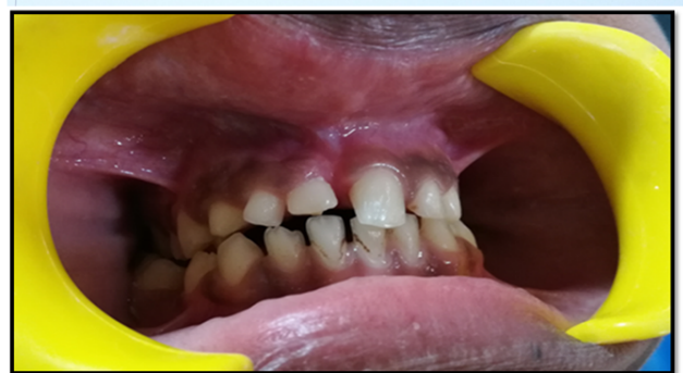
Figure 6: The retained deciduous teeth 51 and 52.

Laser frenectomy was performed for high frenal attachment under all precautions. The retained deciduous teeth 51 and 52 was not mobile so it restored with the composite build up and planned for implant prosthesis in the future after completion of growth (Figures 6 and 7).