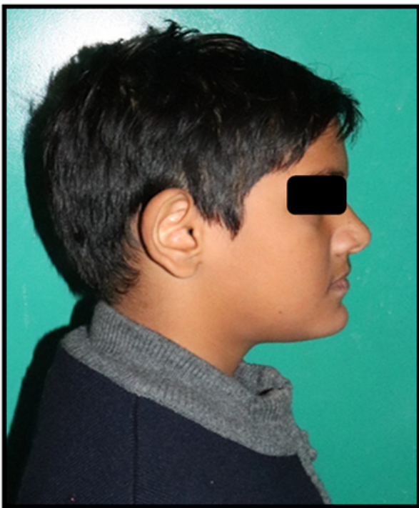
Figure 2: Extraoral examination of the face mimics that of the edentulous person, with a mandibular protrusion, maxillary retrusion and deep sulcus.