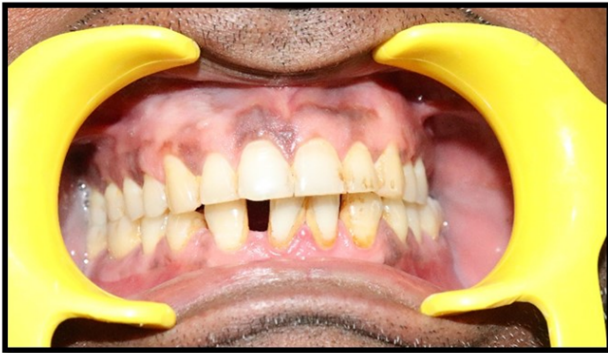
Figure 1: Missing lower right lateral incisor.

of serum calcium, alkaline phosphate, T3, T4, TSH was on the normal range.