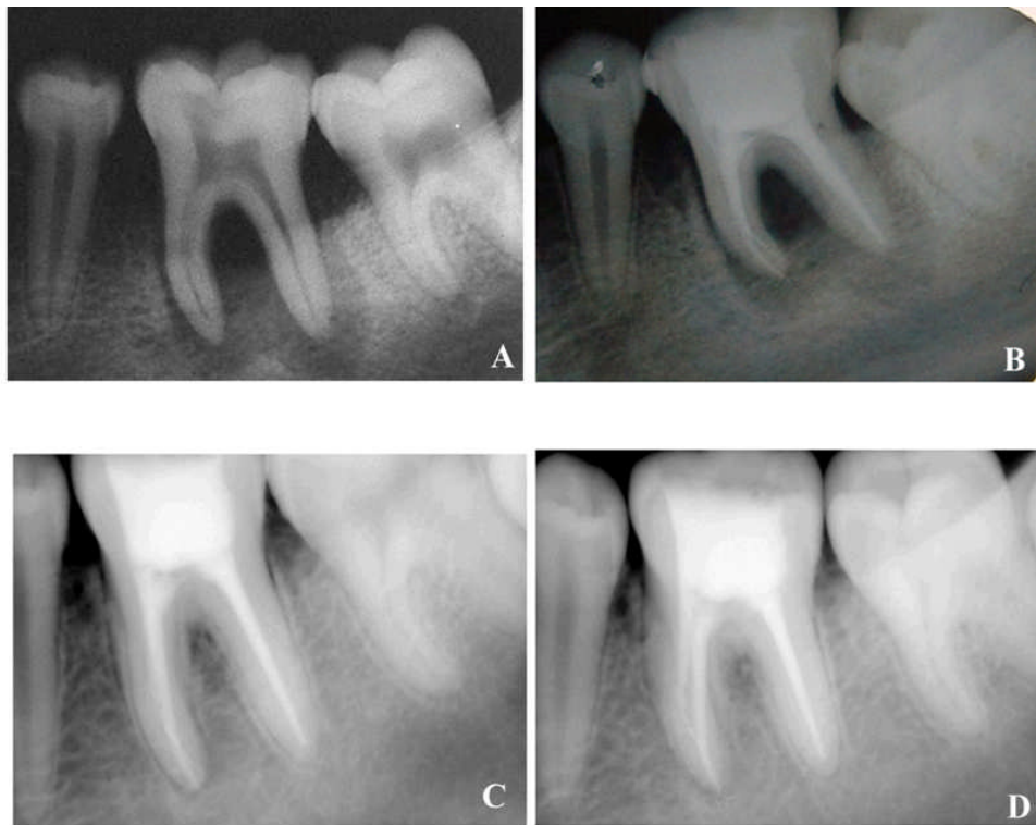
Fig.3 (A) Preoperative radiograph of tooth #19 extensive periradicular bone loss. (B) Radiograph taken upon completion of root canal treatment. (C) One year follow up radiograph showing evidence of bony healing (D) One year and six months follow-up X-ray film showing considerable bone apposition, probing depths were of no more than 3mm all around the tooth.

endodontic involvement, or true combined lesions. Later, an additional classification was added by Belk and Gutmen as concomitant endodontic and periodontal lesions 10 . Formulating a differential diagnosis among combined lesions has always been challenging because most often clinicians do not have a complete history of the course of disease progression.