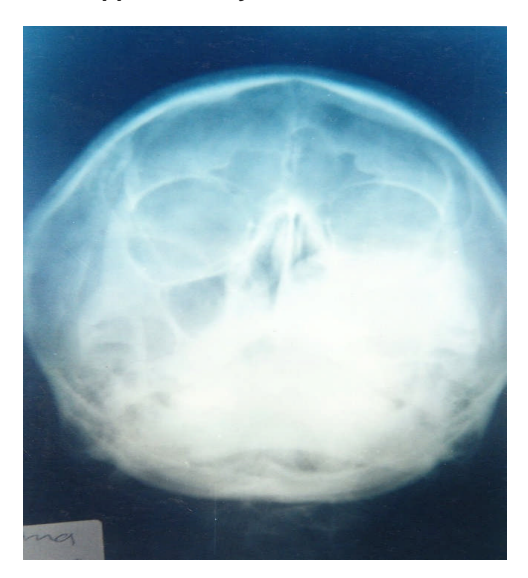
Fig.2. Waters view - showing diffuse radioopacity approximately 4x4 cms in size in the left maxilla