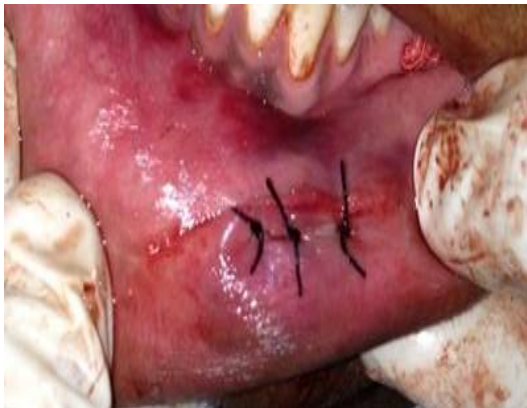
Fig3-Excision of Mucocyst followed by suture placement