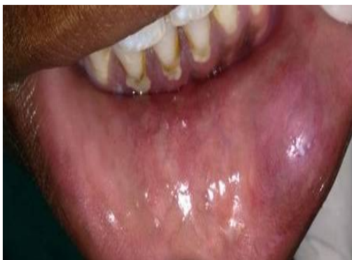
Fig 1a,b-Dome shaped translucent swelling with slight bluish hue on left side of Lower lip