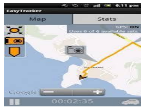
Fig.2.Screen shot recording newtrack for EasyTracker

In the general-purpose category, which targets to people who simply like to track and visualize their routes, Google's "MyTracks" is the most famous application for Android O/S. We have to note that this application is a relatively simple tracker with no advanced features, however it has more than 10 million downloads. Other similar applications in the same category include "AndAndo, "EveryTrail", which has more advanced features by allowing users to add pictures or points of interest and create guides, and "OruxMaps", which allows utilizing various kinds of maps. Another category is about applications focusing on sports/fitness. Here we find many specialized features like the computation of calories consumption or the measurement of heart rate utilizing internal or external sensors. An applications designed to track lost devices or devices that belong to another person (assuming permission is granted). For instance, tracking a smartphone is feasible nowadays with the assistance of GPS and wireless networks.