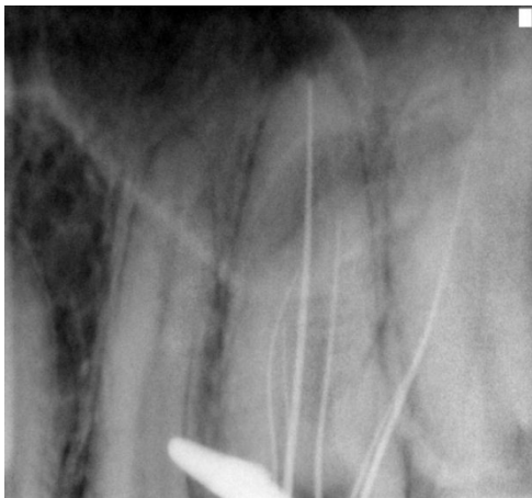
Fig .2 working length radiograph showing 6 canals