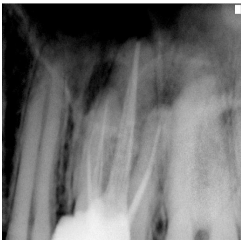
Fig. 3 Post obturation radiograph