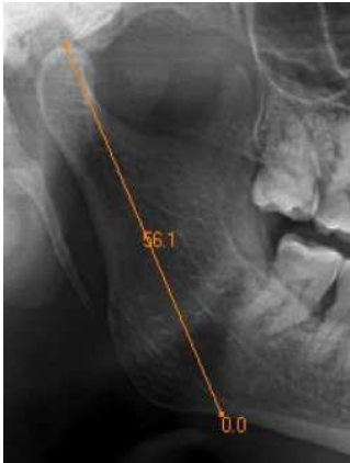
Fig. 2: Cropped panoramic image showing measurement for condylar height