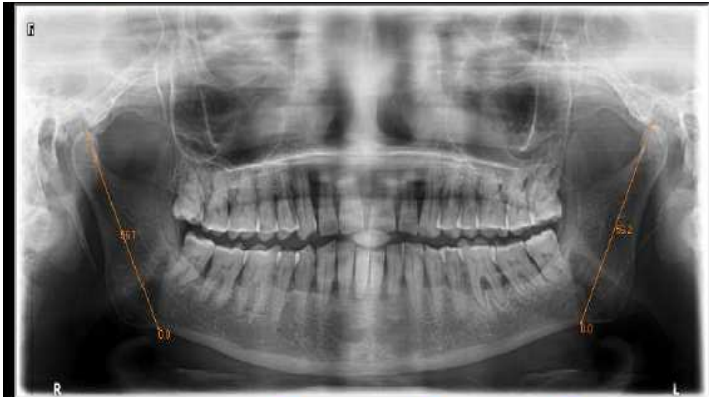
Fig. 1: Panoramic image showing measurement for condylar height in Kodak dental imaging software