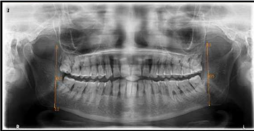
Fig. 3: Panoramic image showing measurement for coronoid height in Kodak dental imaging software