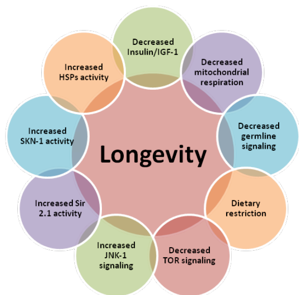
Figure 2. Increased/Decreased cellular signaling response promoting longevity in C. elegans

The advancement in field of biogerontology unravels various multiple cellular signalling pathways and genes controlling lifespan [13]. The discovery of elicitors of lifespan extension has led to development of antiaging research. In recent years, several bioactive phytochemicals have been reported for their anti-ageing activity in C. elegans and due to higher homology of C. elegans with mammals these bioactive phytochemicals find their pharmacological application in mammals too [11]. Many of these bioactive phytochemicals directly or indirectly influence the aging in organisms and found to have protective effect against age related cellular stress [11]. These natural molecules alleviate age related pathology by targeting longevity promoting signalling pathways involving nutrient sensing and maintenance of mitochondrial redox homeostasis. These natural molecules extend lifespan and reduce age related pathologies [11]. The molecular mechanism and interaction of some selected natural bioactive phytochemicals (Table 1) are described below.